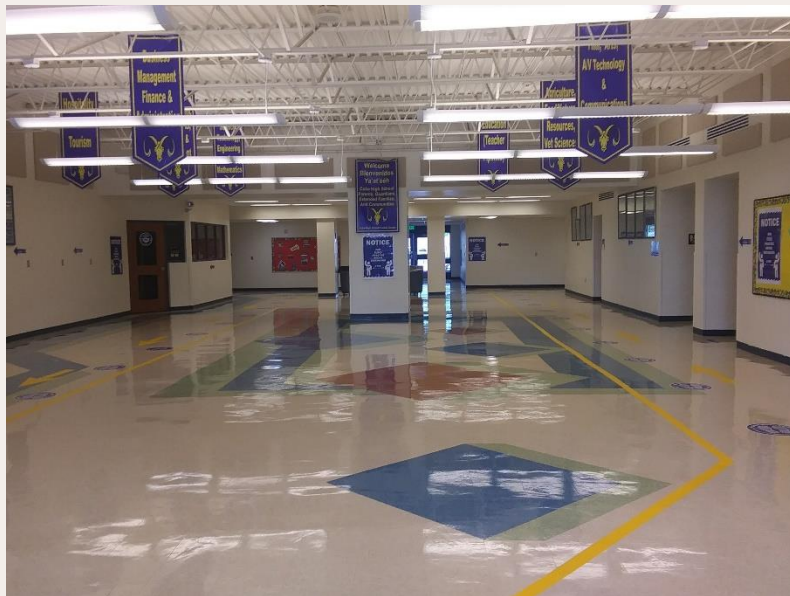
Arrows and signage in all areas of the High School

CISD HAS PLANNED FOR THE HEALTH AND WELL BEING OF ALL WHO ENTERS THEIR DOORS